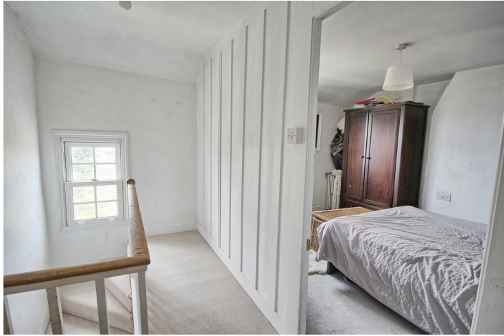
BEDROOM TWO 12'5" x 11'11" (3.79 x 3.64 )