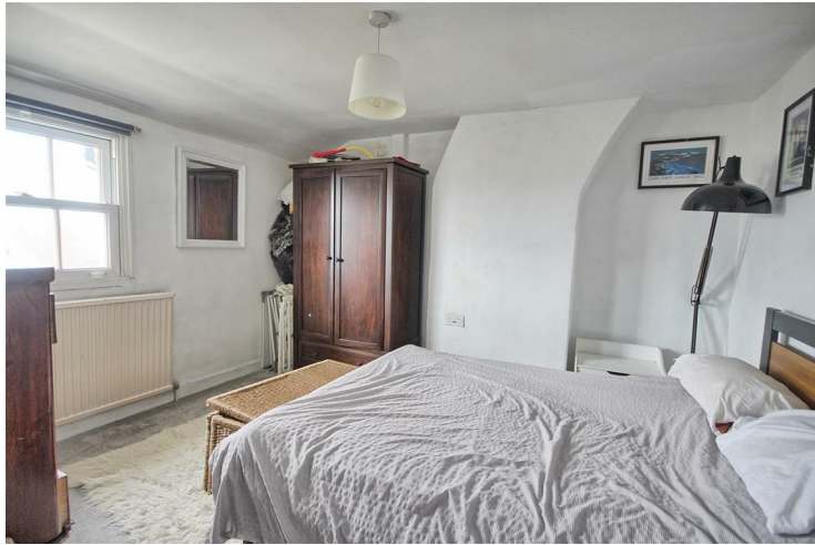
BEDROOM THREE 10'2" x 10'1" (3.10 x 3.08)