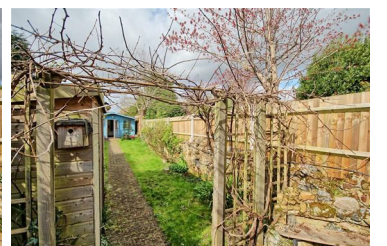
HOME OFFICE/SUMMER HOUSE 13'5 x 11'8 (4.09m x 3.56m)